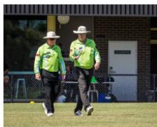
Former SECA Players > Now SECA Umpires