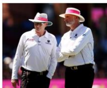
Former Test Players > Now Test umpires